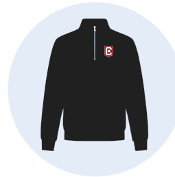
Quarter Zip Up October