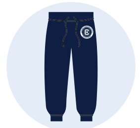
Shorts / Pants For Physical Education Class Only