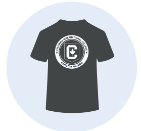
T-Shirt For Physical Education Class Only