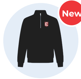
Quarter Zip Up October